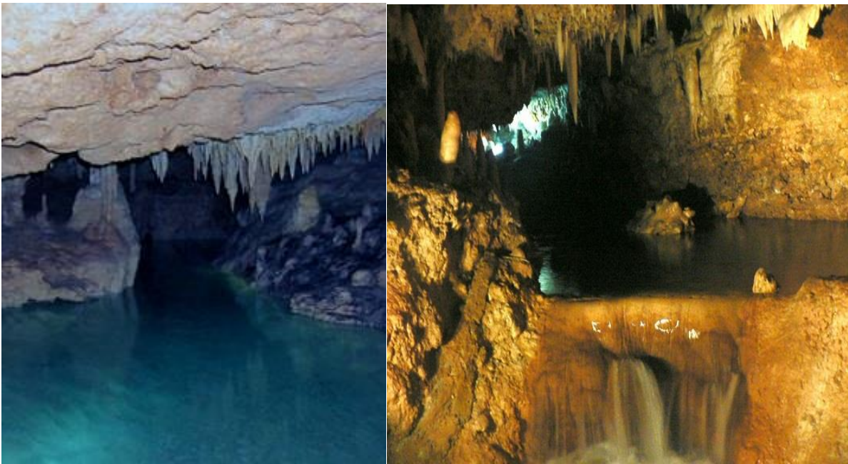
Skeleton <area #1> and various spots in the caves